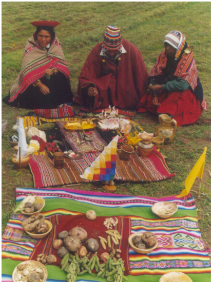
[foto 3: 'whole altar' with from left to right: Mamataria, 2 nd Apomallcu and 2 nd Mamataria]

The second part of the altar consists of a collection of vegetables. In the dishes they have collected the best products of last year's harvest: potatoes, quinoa , broad beans and more. It is the symbol of life and the prevention of sickness. The products in the middle refer to the harvest of this year, for which they expect good results. And again, the four sides of the cosmos are represented by the flags around the altar.