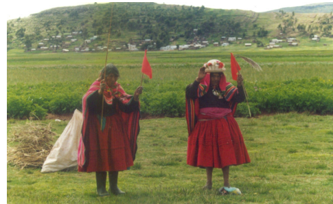
[foto 4: Two women welcome the Sun. The plume in their hands represents the germ of a plant.]

After welcoming the Sun, all participants were asked to welcome Mother Earth and show her respect by going down on our knees and by putting our foreheads to the ground.